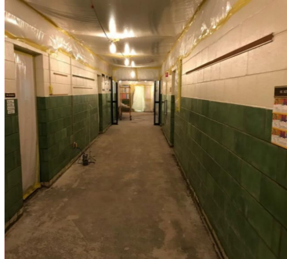
Evans asbestos abatement is now complete