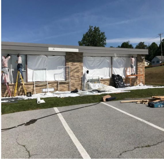
Out with the old, in with the new windows at Brinckerhoff