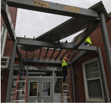
Fishkill's security vestibules