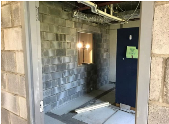
New green rooms at John Jay