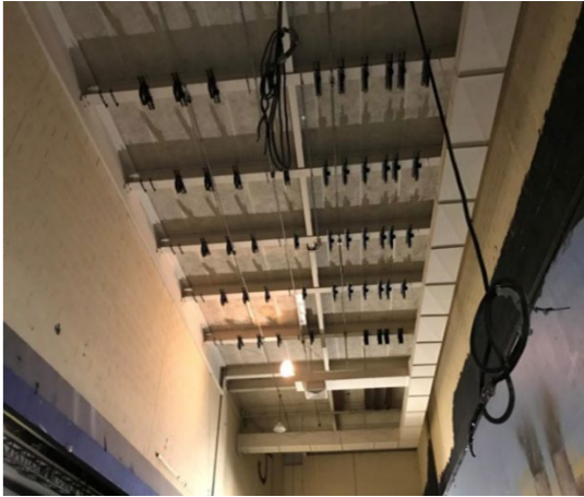
John Jay stage rigging