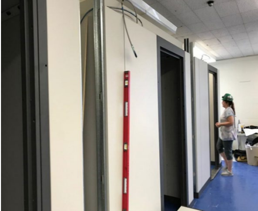
John Jay new sound-proof practice booths