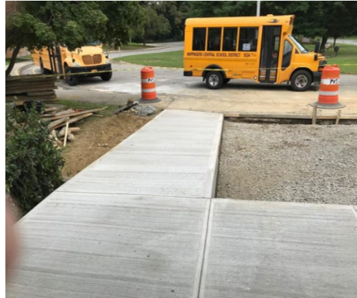
Sheafe Road's new security vestibule entrance