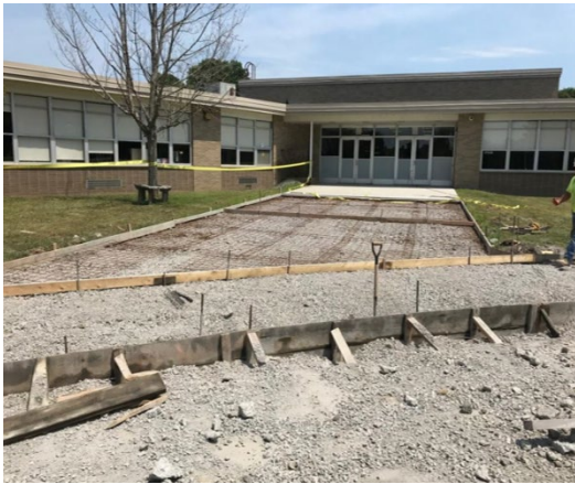
Gayhead's defective sidewalk replacement