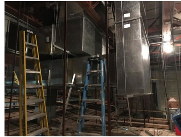
New duct work installation at JJ auditorium