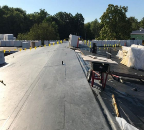
Fishkill Plains new roof